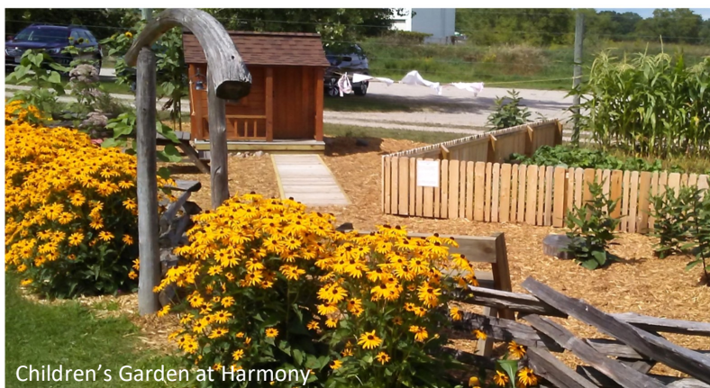
Children's Garden at Harmony

Being a certified master gardener is not a requirement.