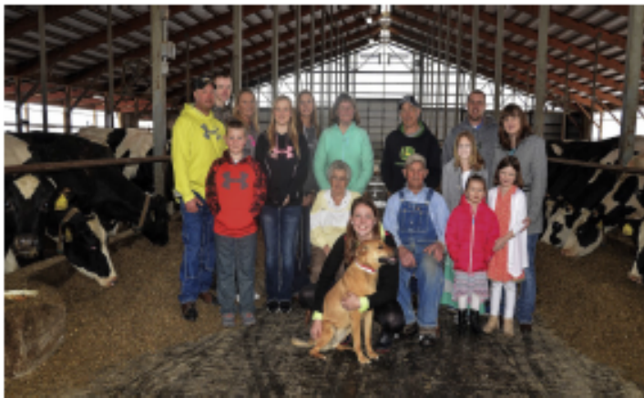
Pancakes, eggs, sausages, cheese curds, maple syrup, applesauce, milk, juice, coffee, ice cream sundaes