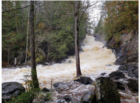
Long Slide Falls after heavy rain

4-H is no stranger to change either. Last month, I introduced myself as the new 4-H Program Coordinator – a career change for me and a change in staffing for you. What other changes are coming? Some of you have completed your club charters and have noticed the request to create goals for expanding access to our 4-H clubs which is a change from what has been asked in the past. One of our goals is to make sure that we are serving our communities as best as we can and making sure we offer opportunities to everyone.