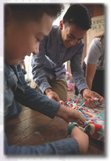
Completing a craft project or helping out with a club community service project are great things to include in your records!

An EEO/AA employer, University of Wisconsin-Madison Division of Extension provides equal opportunities in employment and programming, including Title VI, Title IX, the Americans with Disabilities Act (ADA) and Section 504 of the Rehabilitation Act requirements.